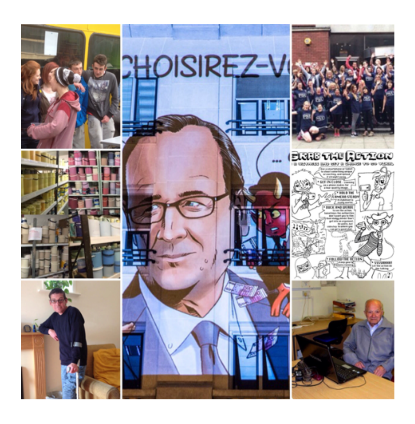
THE SCURRAH WAINWRIGHT CHARITY REVIEW OF GRANTS 2014