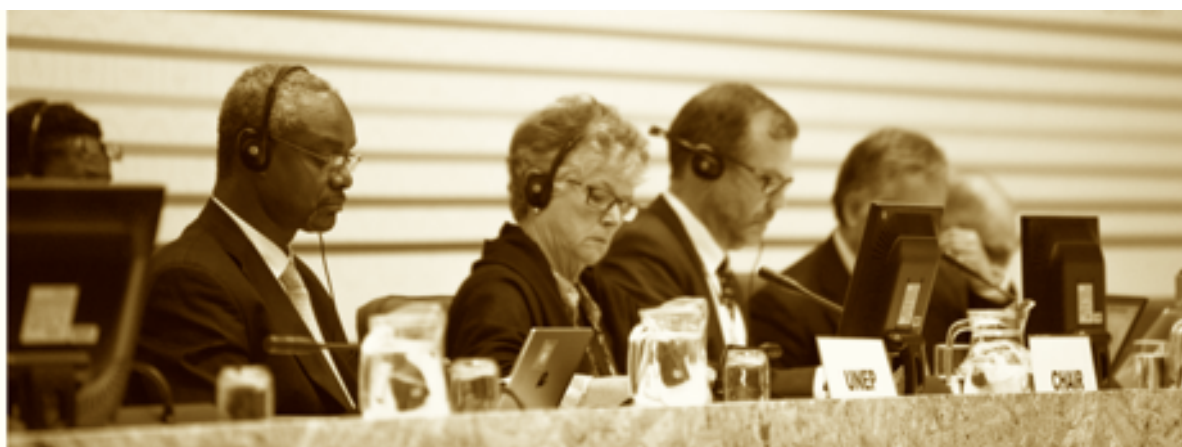
Governments in Nairobi met this week to set the global priorities for the environment at the second UN Environment Assembly. The assembly passed the most significant UN resolution on conflict and the environment since 1992.

The chain of events began when CADU failed to raise enough funding for the Iraq project and at the same time, ICBUW lost the support of the Norwegian government, its prime funder for five years, following a general election which saw a centre-right government take power. With the support of the SWC and other charities, fundraising events, consultancy work and individual donations, the TRW project raised enough money to retain one full-time and two part-time staff for the duration of the 2015-16 financial year. It proved a difficult period. As well as its research, TRW had to work on revised bids to state donors while launching a major report outlining how a new mechanism for post-conflict environmental assistance could work.